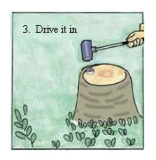
Drive the ECOPLUG® into the hole with a hammer.