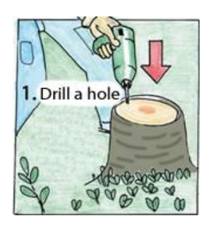
Drill a hole close to the bark, from above or from the side, 30-35 mm deep, using a 13 mm drill bit.